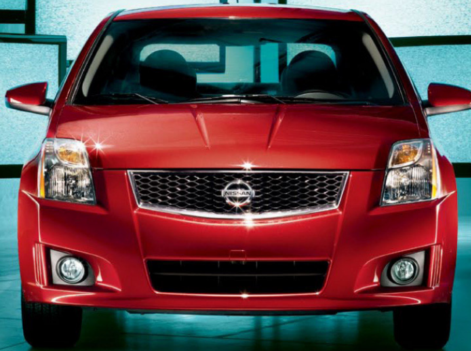
Nissan Sentra 2.0 SL shown in Red Alert.